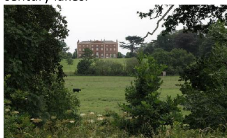
Serlby Hall and parkland