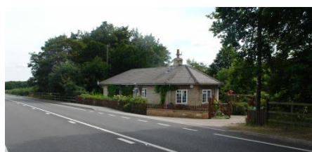
Bawtry Lodge, Bawtry Road