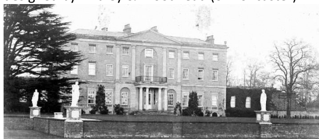
Serlby Hall, c1920

The 4 th Viscount Galway had the park remodelled in c1804, designed by John Webb iv (former partner of William Emes), with the canal reformed into a 'naturalistic' lake, various tree clumps planted/formed and a number of lodges added. The 5 th Viscount Galway remodelled the house in 1812, designed by Lindley & Woodhead (of Doncaster) v .