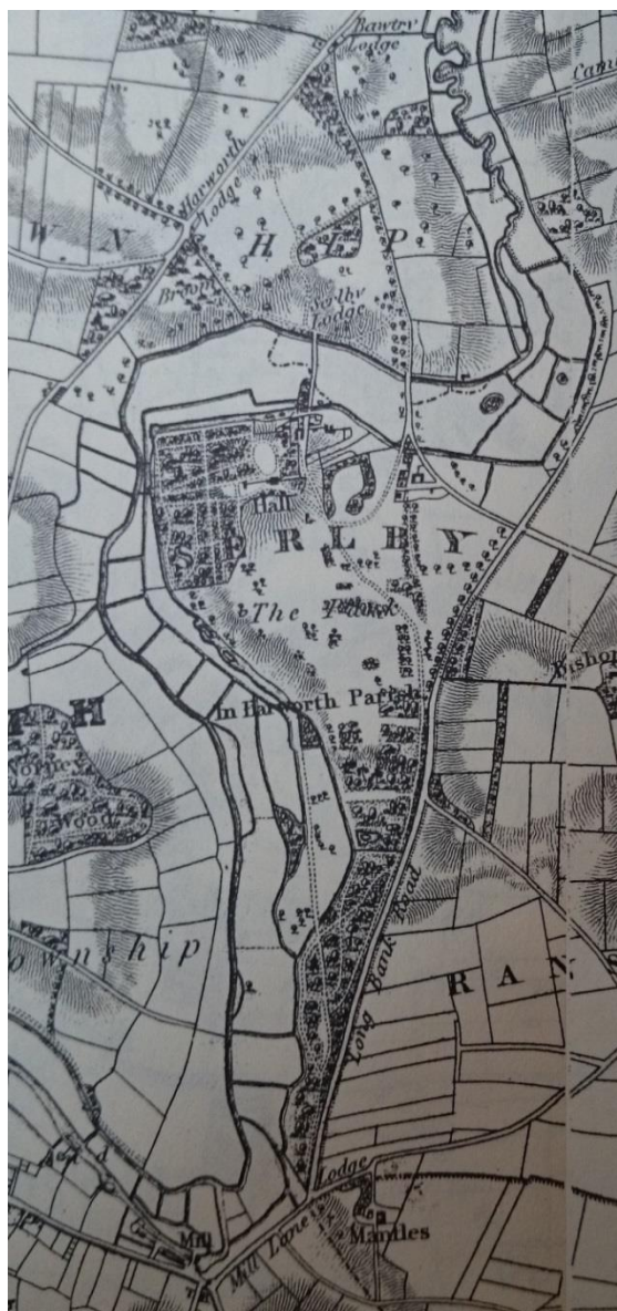
1835 Sanderson's Map (Nottinghamshire County Council, 2003)

In 1725, John Monckton (the 1 st Lord Galway) purchased Serlby Hall i and in 1740, began remodelling