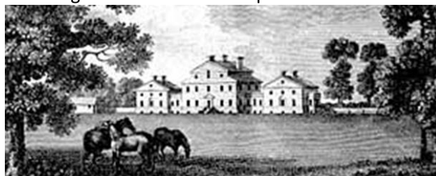
Serlby Hall, c1790

the park, including formal rides, avenues, a west-to-east canal to the north of the hall and numerous beech trees throughout the park ii . He also laid foundations for a replacement hall, although it was never built. The 2 nd Viscount Galway built the replacement hall, although not to the earlier plan, instead it was designed in c1756 by James Paine and was completed before 1771 iii . Numerous outbuildings including stables, tennis pavilion and kitchen garden all date to this period.