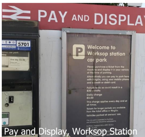
Pay and Display, Worksop Station