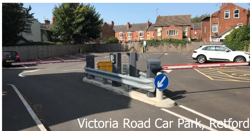
Victoria Road Car Park, Retford