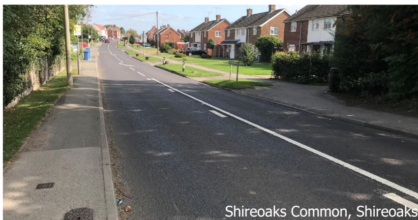
Shireoaks Common, Shireoaks