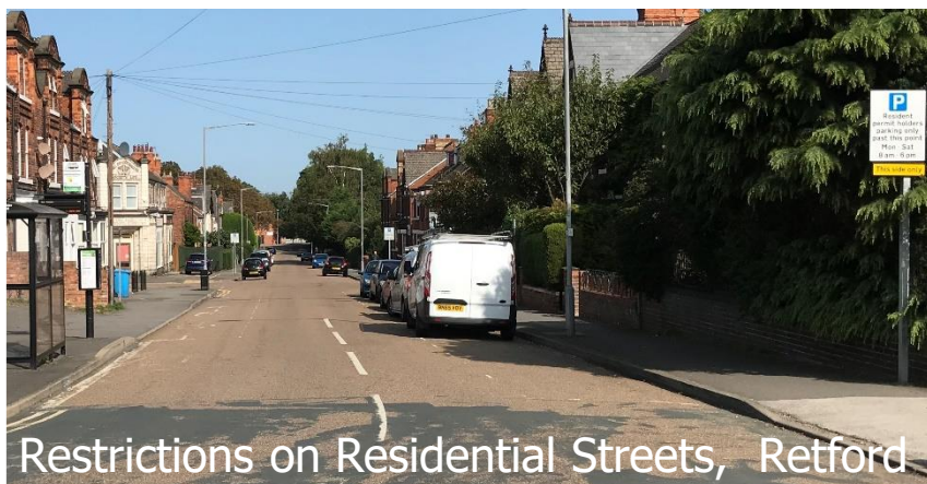
Restrictions on Residential Streets, Retford