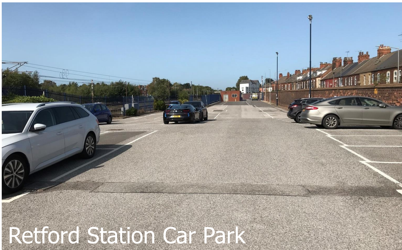
Retford Station Car Park