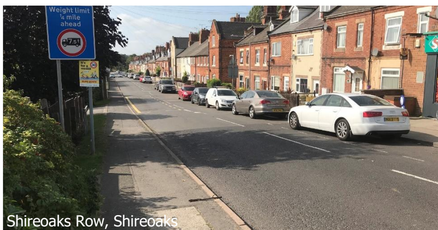
Shireoaks Row, Shireoaks