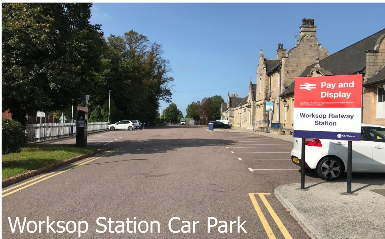
Worksop Station Car Park