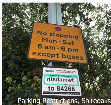
Parking Restrictions, Shireoaks